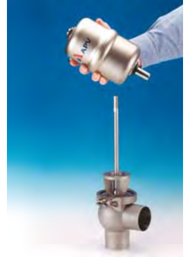
Reversible valve orientation for either normally closed or normally open operation.