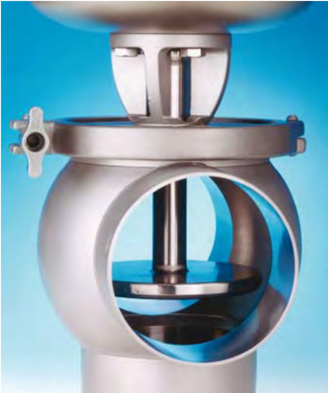
Ball-shaped, pocket- and crevice-free housing.