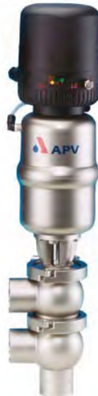
Option examples (L to R): Tangential body (right hand type shown); SW4 6" OD tube size valve; and typical SW4 divert valve with CU control unit.